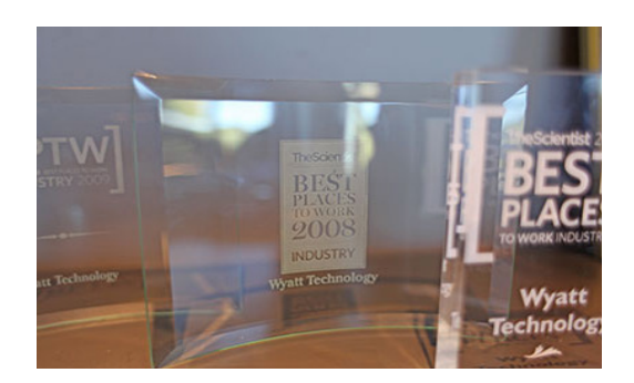
The Scientist magazine recognized Wyatt Technology as one of the best places to work in the industry for the 5th consecutive year!